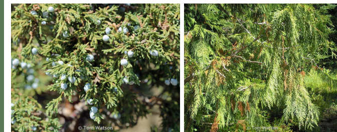
Rocky Mountain Juniper