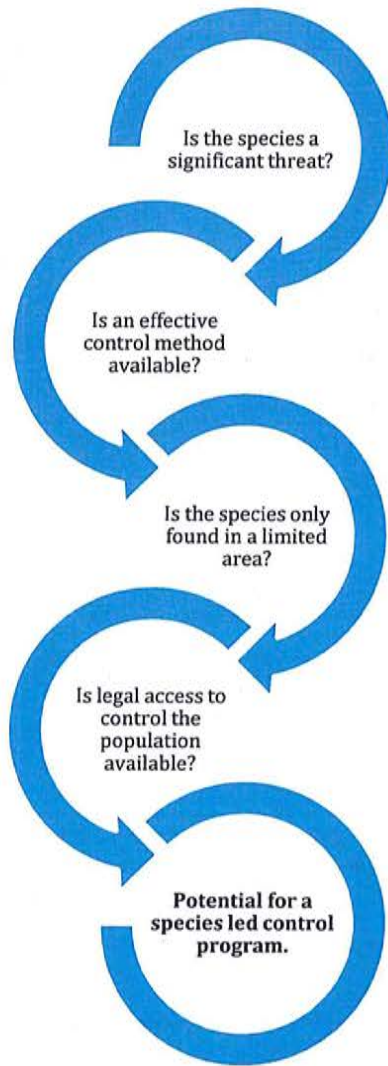
Figure 2. Assessment questions to determine if a species is a good candidate for a species-led control effort. If any of the answers are “no”, rapid response is not recommended.

If the species is detected or reported after optimal detection conditions have passed for the year (e.g. swimming veligers for dreissenid mussels require water temperatures above 10C, flowers for identification on terrestrial plants, etc.) the decision on how to proceed should consider the risk of delay compared to the cost of aggressive management. Survey work should continue concurrently with verification and risk assessment.