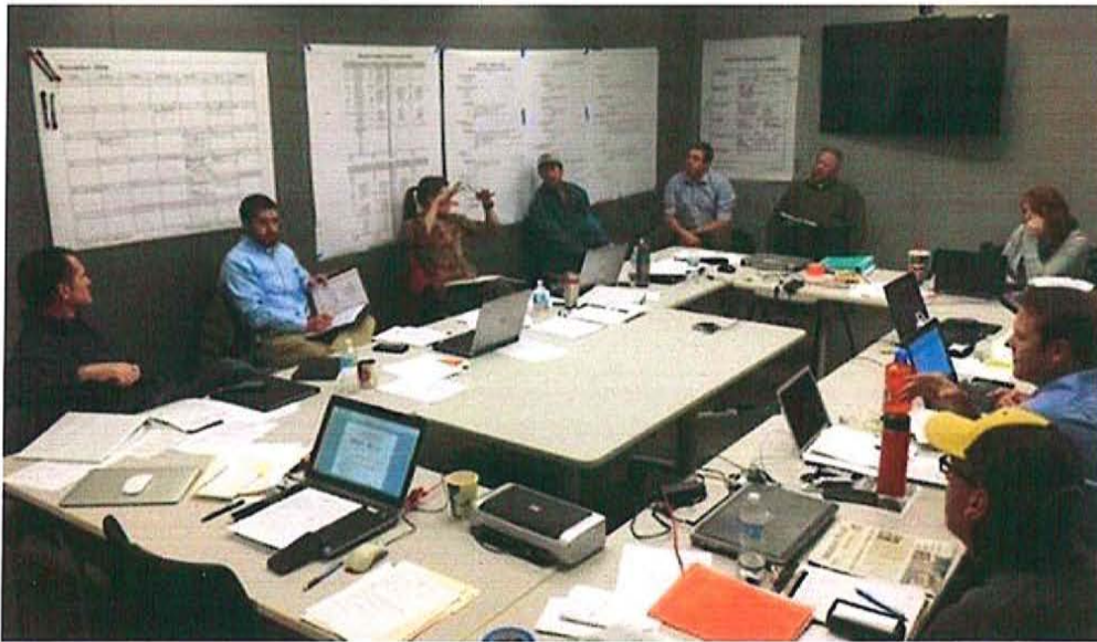
Figure 5. Incident Command System planning continues through the transition to ongoing management.